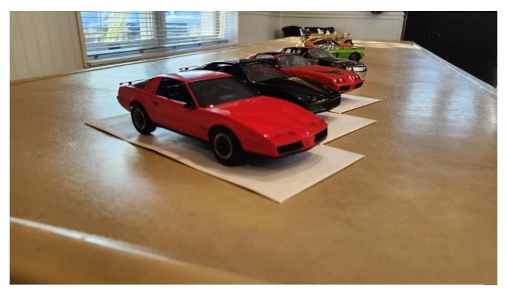
Goodies for sale