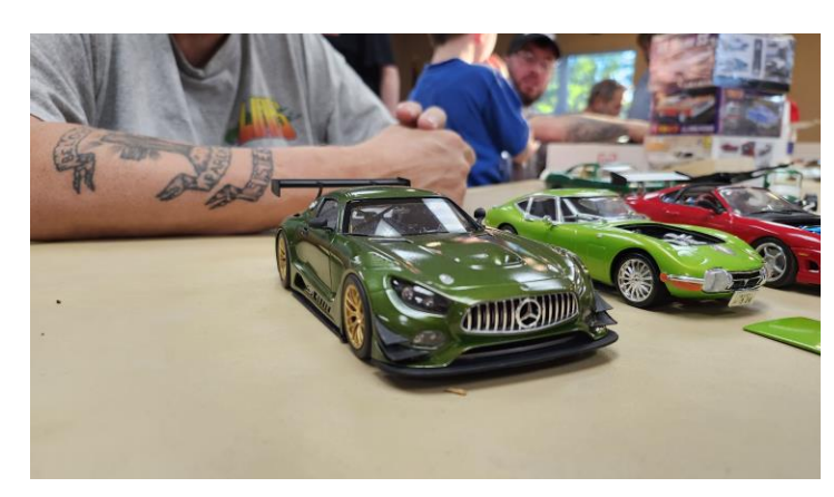
Works of art from yours truly